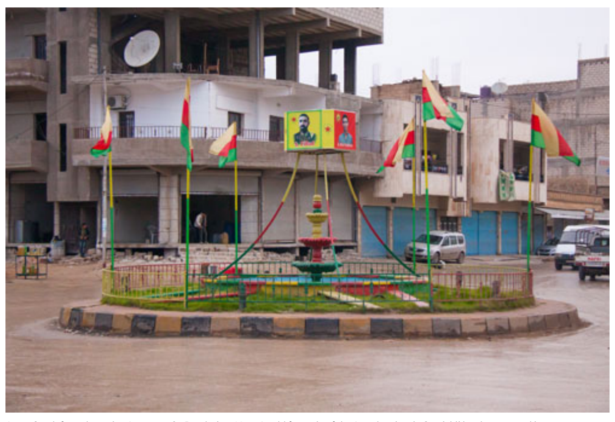
Jonas Staal, from the series Anatomy of a Revolution, 2014. An old fountain of the Assad regime in Qamishli has been turned in to a monument to the Rojava Revolution, painted yellow-red-green – the colors of the flag of the independent cantons – carrying several martyr portraits of deceased revolutionaries from its defense forces.