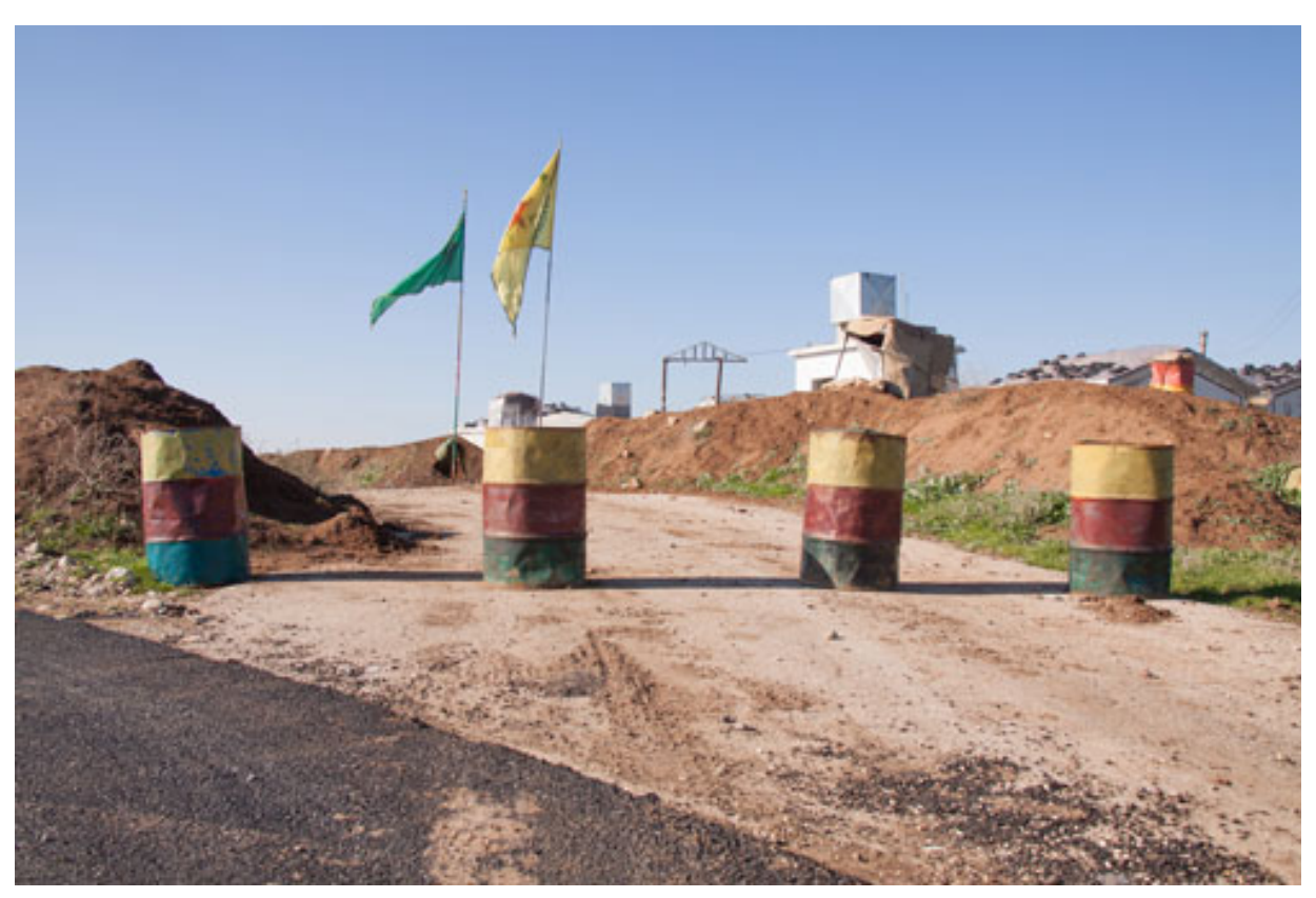
Jonas Staal, from the series Anatomy of a Revolution – Rojava, 2014. Entry of a training camp of the People's Defense Forces (YPG) and Women's Defense Forces (YPJ) after crossing the border from Iraqi-Kurdistan to Syrian-Kurdistan into the autonomous canton of Cizîre.