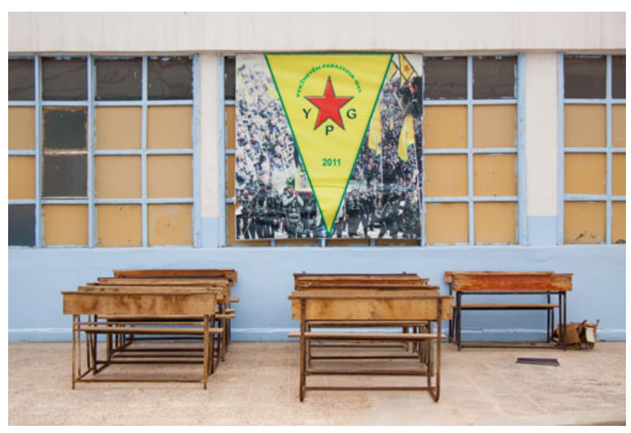
Jonas Staal, from the series Anatomy of a Revolution – Rojava, 2014. Classroom for ideological education of the People's Defense Units (YPG).