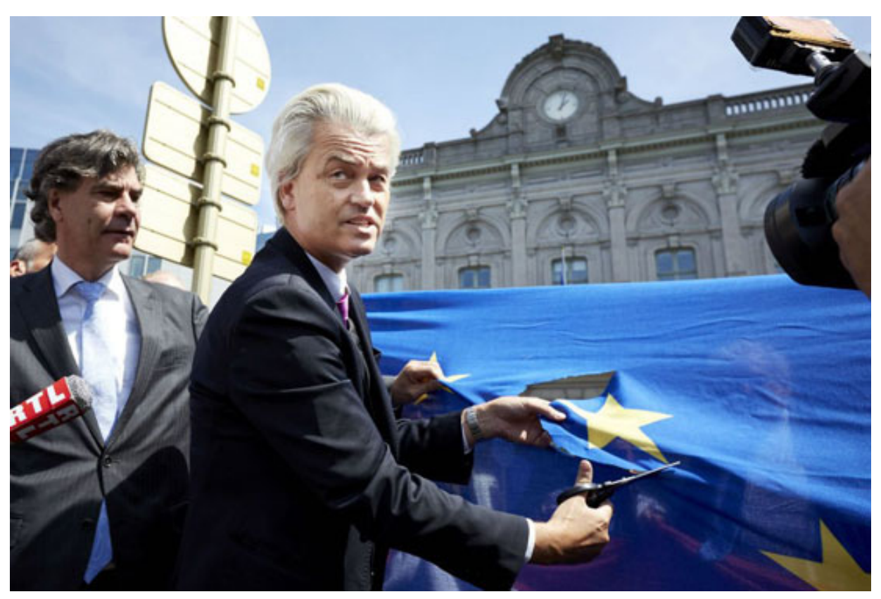
Geert Wilders, leader of the Dutch Freedom Party (PVV), cutting a star from the EU flag in front of the EU Parliament building in Brussels on May 20, 2014. He then unfolded the Dutch flag, as a performative act in support of a Dutch withdrawal from the union.

During the European elections, some political parties and commentators attempted to combat ultranationalism by making the contradictory claim that far-right parties only wanted to enter the European Parliament in order to stop it from "inside," so as to wrest back state sovereignty from the moloch of Brussels. But this strategy is nothing but an ideological cover-up for the fact that the ultimate consequence of ultranationalism is the annihilation of parliamentary representation