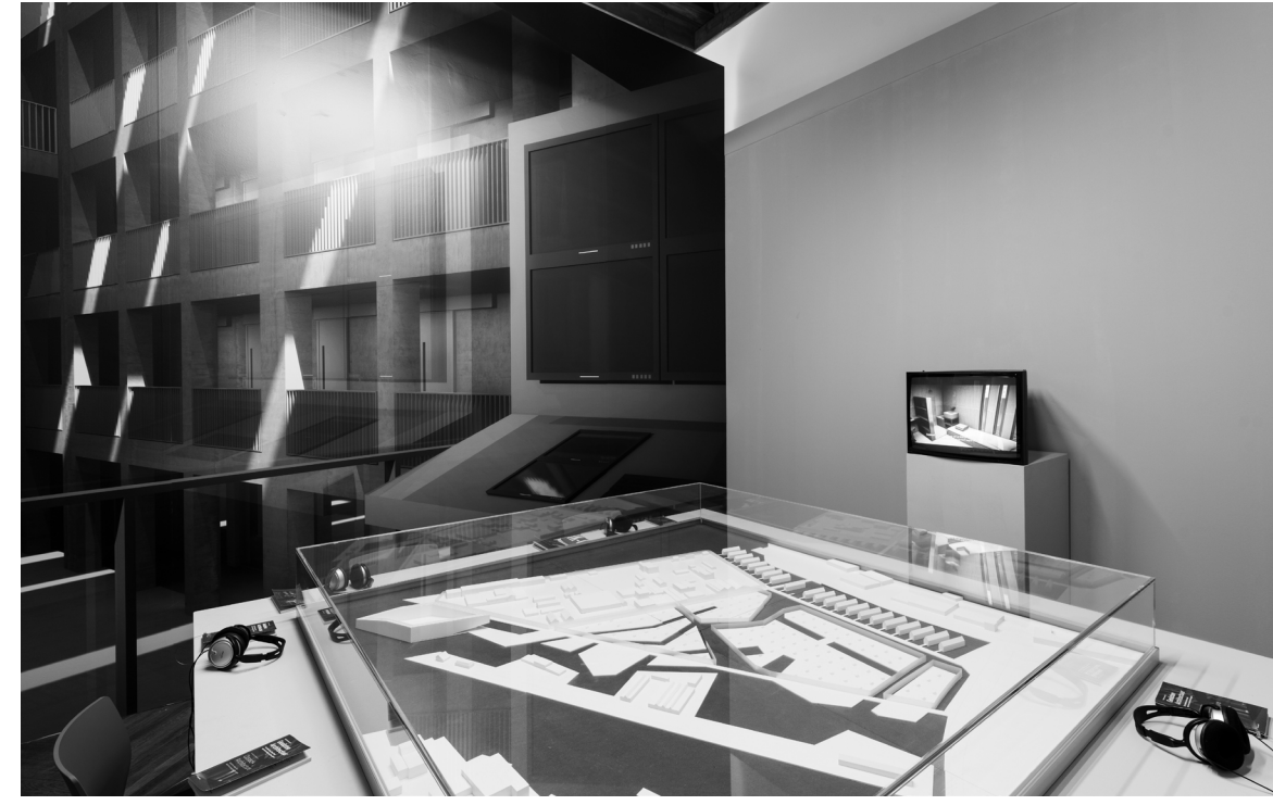
Closed Architecture by Jonas Staal (2011) as presented at IK-00: The Spaces of Confinement, Casa dei Tre Oci, Venice, 2014.