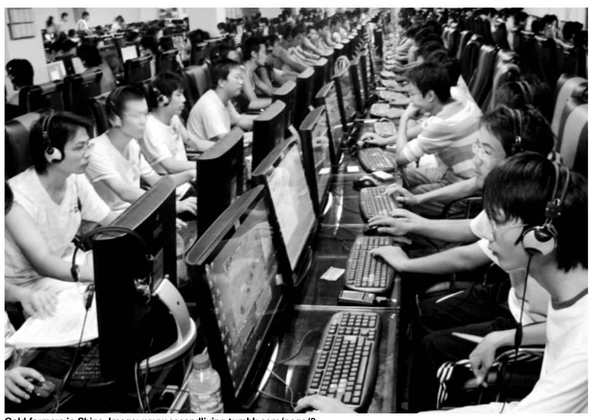
Gold-farmers in China. Image: www.secondliving.tumblr.com/page/3