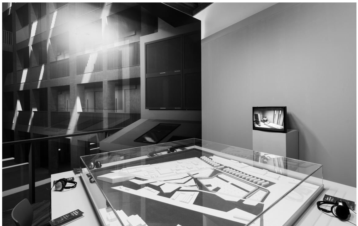
Closed Architecture by Jonas Staal (2011) as presented at IK-00: The Spaces of Confinement , Casa dei Tre Oci, Venice, 2014.