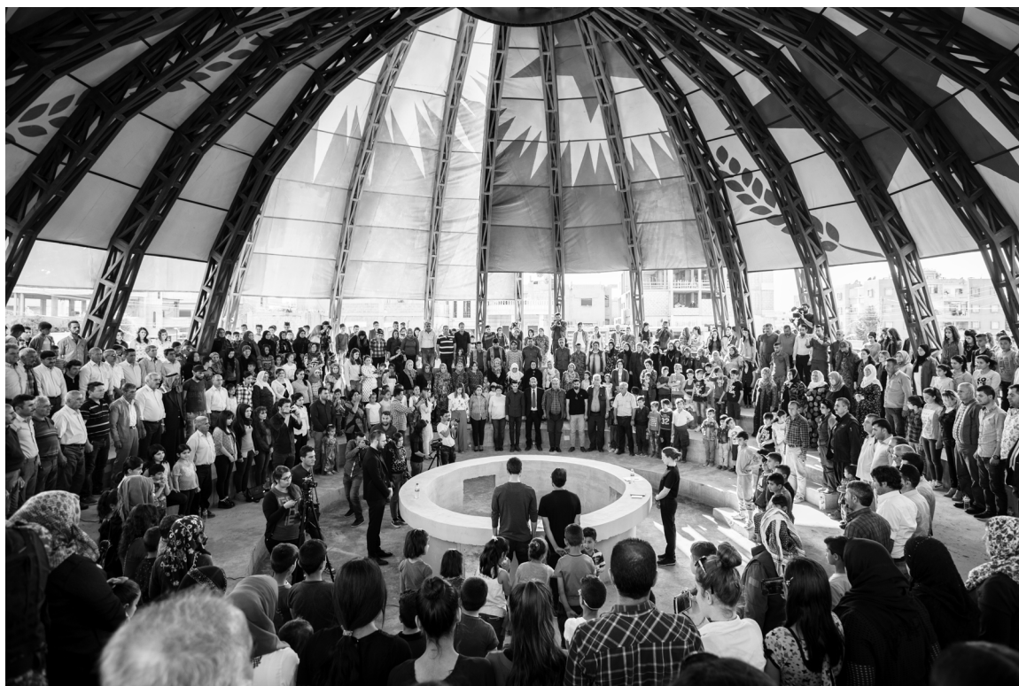
Inaugural ceremony of the People's Parliament of Rojava in April 2018 in Dêrik, Rojava, as part of New World Summit – Rojava (2015-18) by Democratic Federation of North-Syria and Studio Jonas Staal.

The New World Summit , a series of alternative parliaments, embassies, and schools that I developed with and for stateless, blacklisted, and autonomist groups is indeed an example. In the War on Terror and its 'Us versus Them' dichotomy, the notion of the terrorist has come to designate a threat to democracy. But what if capitalist democracy and its imperialist wars are itself the threat, and the 21st century state terror is what we truly need to be afraid of? When I organized the first summit in Berlin in 2012, various blacklisted organizations joined the assembly, such as the Basque independence movement, the Kurdish Women's movement, and the National Democratic Movement of the Philippines. Each was faced with blacklisting, but each propagated