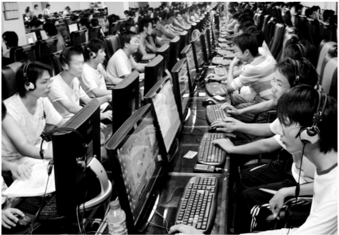
Gold-farmers in China.