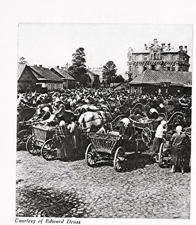
MARKET PLACE IN A TOWN; THE PEASANTS HAVE COME IN FROM SURROUNDING VILLAGES

Maurice Hindus, Red Bread, 1931 (opening page).