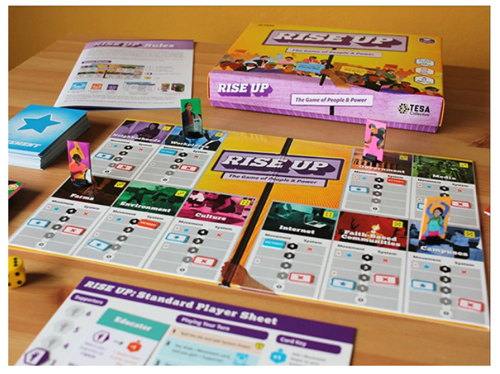
TESA Collective, Rise Up: The Game of People & Power , 2017.

In these examples – from Paris Marx's mappings of nationalized trillion-dollar companies, to Varoufakis's description of another now, to the training of cooperative mentalities by TESA Collective and Balaguer – collectivized imaginaries serve as the foundation for constructing collectivized realities.